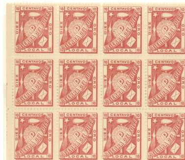
• 'Mother Stamps' Argentina - early 1890s

ARGENTINA - In remote Tierra del Fuego, a local post was operated in the 1890s by Julius Popper, a Romanian holding a gold-mining concession. He privately issued a single 10 centavos 'oro'/gold stamp circa 1891 for use on local mails. The stamps depict mining equipment with a central 'P' for Popper.