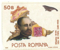
• 'Offspring' Romania - 1986