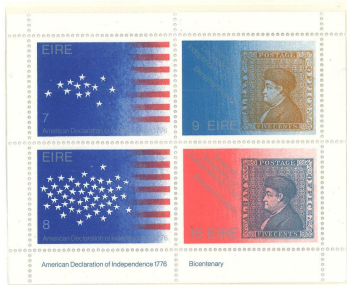
• 'Offspring' Ireland - 1976

ESSAYS - An essay is a design for a stamp submitted to a government for approval. However, there is no guarantee that it will be either accepted or officially issued in the same detailed design as the original.