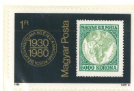
• 'Offspring' HUNGARY - 1980

HUNGARY - The 1921-25 issue (10 stamps) contained an image of a Madonna and Child. The only error in that series, and the most significant error in Hungarian philately, is the 5,000 kreuzer value with its center inverted. Of the 100 such stamps issued, over 40 are held in museums. This is one of the finest of the remaining number in public hands. Certificate