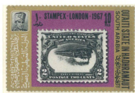
• 'Offspring' QU'AITI STATE - 1967