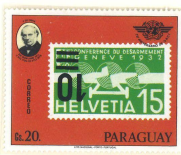
• 'Offspring' PARAGUAY - 1979

SWITZERLAND - In 1935, a stamp series was issued to change the values of an earlier series that commemorated the International Disarmament Conference in Geneva (1932). An error occurred in one sheet of 50 during the process of adding a 10 centimes charge to the original 15 centimes value. The inverted surcharge is one of the most significant errors in modern Swiss philately. It is estimated that approximately two dozen are available outside museums. Certificate