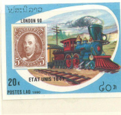
• 'Offspring' LAOS - 1990