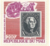
• 'Offspring' MALI - 1979