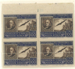
• 'Offspring' SAN MARINO - 1947 Note: perf issues!