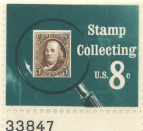
33847 • 'Offspring' UNITED STATES - 1986

(The 5-cent stamp featured the first individual anywhere who was neither royalty nor a head of state - Benjamin Franklin.)