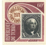
• 'Offspring' CHAD - 1971

(This 10-cent first issue featured George Washington, the first elected official to appear on any stamp.)