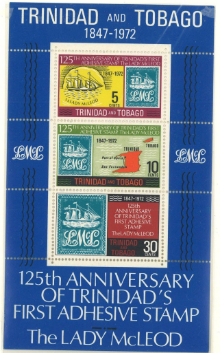
• 'Offspring' TRINIDAD - 1972