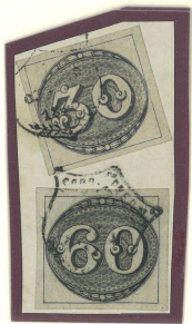
A scarce combination!