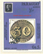
• 'Offspring' PARAGUAY - 1890

30 reis- nicknamed 'OX-EYES' (first stamp in the Americas)